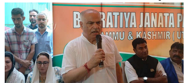
THE KASHMIR TALK BUREAU SRINAGAR:

The Bharatiya Janata Party (BJP) Jammu and Kashmir today organized a grand felicitation ceremony at Church Lane, Sonwar, Srinagar, to honour the newly appointed State Office Bearers of BJP J&K.