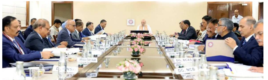
THE KASHMIR TALK BUREAU SRINAGAR:

Stressing the need to establish a dedicated forum to combat the misuse of encrypted communication platforms by terrorist groups, Union Home Minister Amit Shah has emphasised the importance of coordinated efforts and concrete mechanisms to bring back fugitives involved in terrorism and smuggling from abroad.