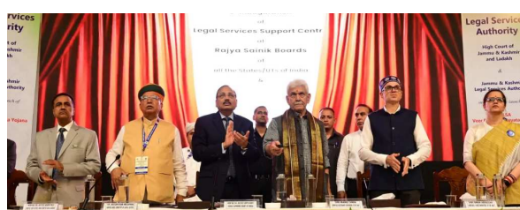
Personnel and Tribals: Bridging the Gaps"

Lieutenant Governor Manoj Sinha today addressed the North Zone Regional Conference on "Reaffirming the Constitutional Vision of Justice for Defence