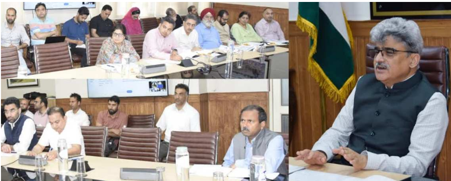
THE KASHMIR TALK BUREAU SRINAGAR:

Calls for developing data-rich dashboards, AI-based citizen services to enhance ease of living