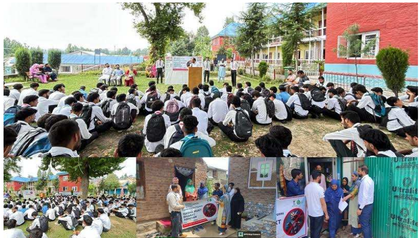
THE KASHMIR TALK BUREAU BUDGAM:

As part of the ongoing Nasha Mukht Abhiyan (Drug-Free India Campaign), intensive Information, Education, and Communication (IEC) activities were successfully conducted at Government Middle