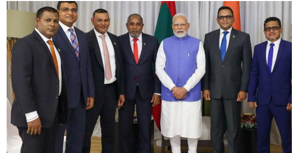
THE KASHMIR TALK BUREAU SRINAGAR:

Prime Minister Narendra Modi on Saturday held a meeting with members of several political parties of the Maldives on the second day of his visit to the island nation and said the participation of leaders across the political spectrum underscores the bipartisan support for the "strong and time-tested" friendship between the two countries.