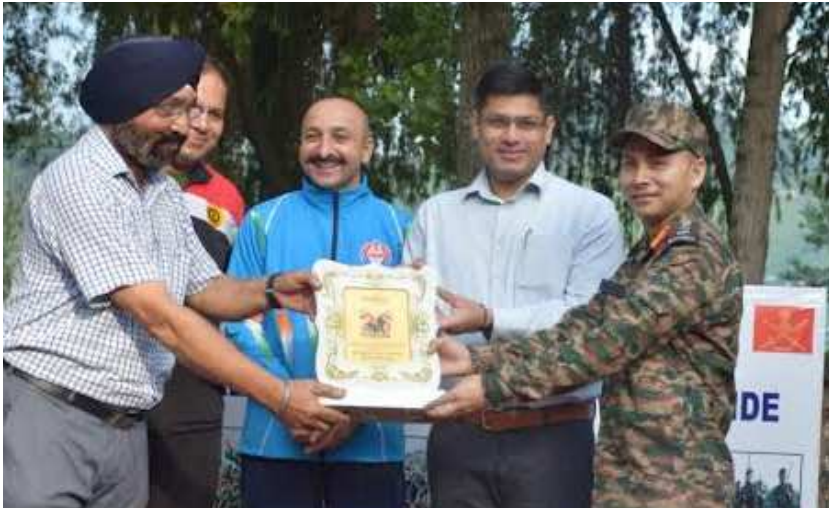
THE KASHMIR TALK BUREAU POONCH:

Deputy Commissioner pays floral tributes to War heroes