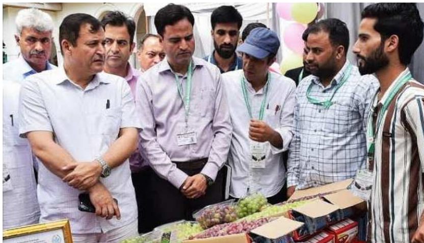
THE KASHMIR TALK BUREAU SRINAGAR:

Pitches for achieving govt's envisioned goals of Horticulture Department