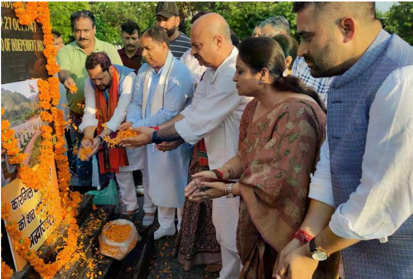
THE KASHMIR TALK BUREAU UDHAMPUR:

The Bharatiya Janata Party (BJP), Jammu & Kashmir, observed Kargil Vijay Diwas across various districts of Jammu & Kashmir, remembering the valour and supreme sacrifice of the Indian soldiers during the Kargil War of 1999. Leaders and cadre of the party organized multiple programmes to pay homage to the martyrs and reiterated their resolve to uphold national pride and security.