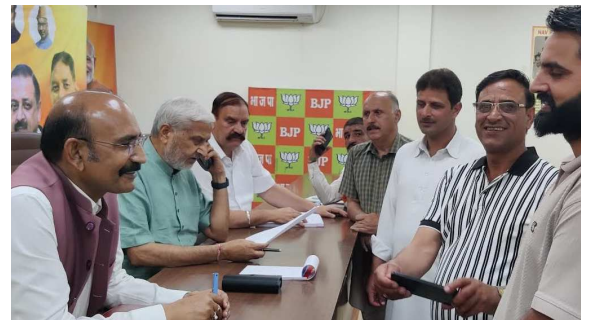
THE KASHMIR TALK BUREAU JAMMU: