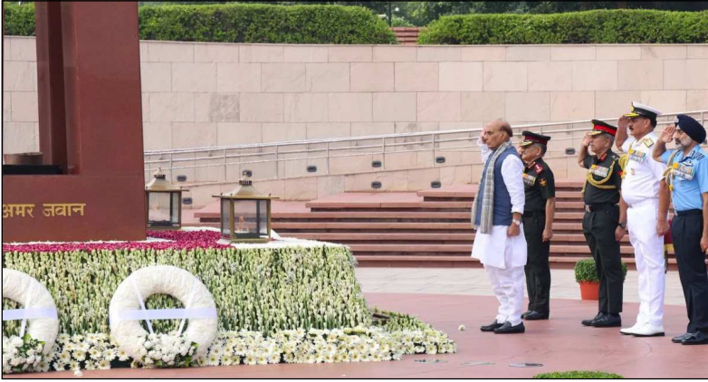
THE KASHMIR TALK BUREAU SRINAGAR:

Stating that the nation will forever remain indebted to the brave martyrs of the 1999 Kargil War, Defence Minister Rajnath Singh paid rich tributes to the fallen heroes at the National War Memorial (NWM), here today. After paying homage and laying